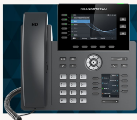
Grandstream GRP 2616 Value of $179

you pay $5.99 /month with 24-month commitment