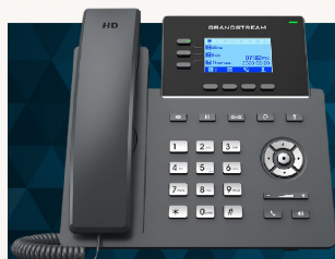
Grandstream GRP 2603P Value of $69

you pay $3.99 /month with 24-month commitment