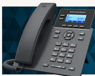
Grandstream GRP2602W Value of $75

you pay $4.99 /month with 24-month commitment