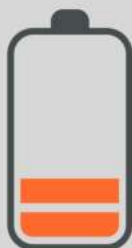
Without Improved Battery Pack 1850 mAh

$29.99 with activation of a qualifying Business Internet Backup Plan