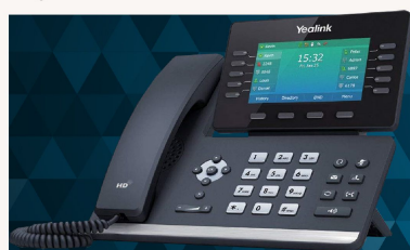
Yealink SIP-T54W Value of $179

you pay $6.99 /month with 24-month commitment