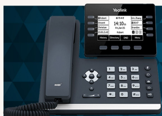
Yealink SIP-T53W Value of $145

you pay $5.99 /month with 24-month commitment