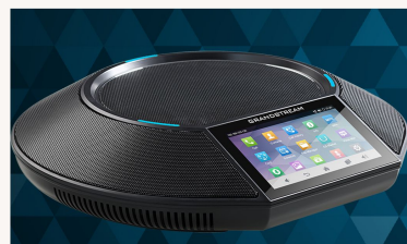
Grandstream GAC2500 Value of $349