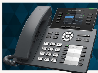
Grandstream GRP 2634 Value of $125

you pay $5.99 /month with 24-month commitment